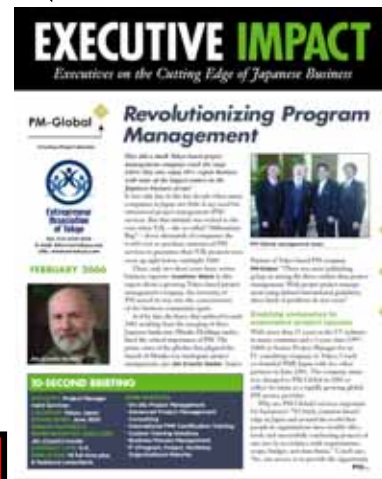
Page 1 of a 2-page document

*Offering of MRP Action Pack subject to certain criteria being met.