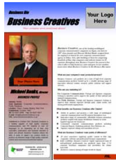
Page 1 of a 2-page document