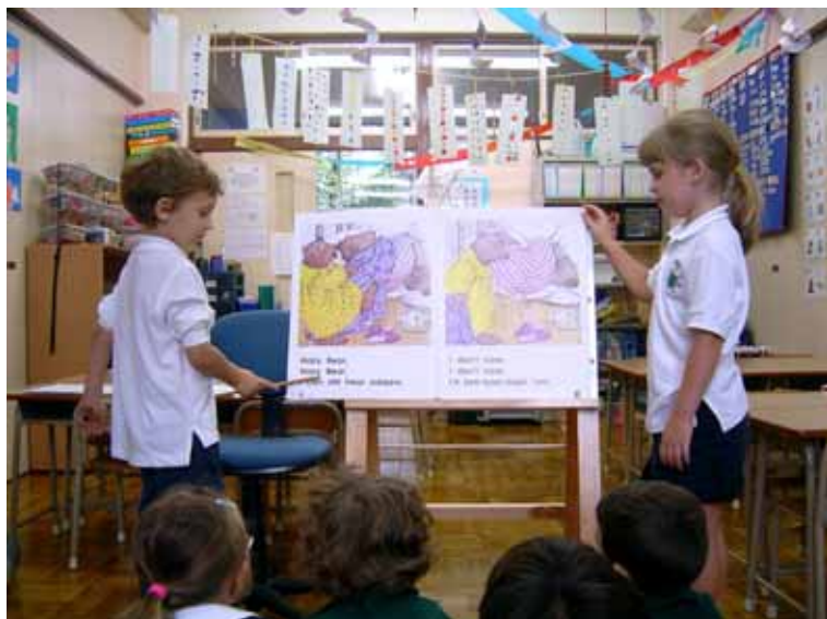
Learning through teaching

For more information: contact Business Grow: info@businessgrow.net